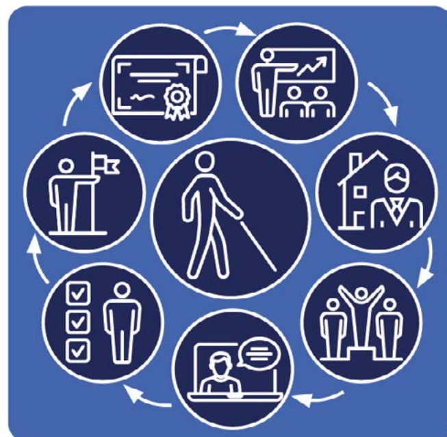
Factors which improve employment chances for blind and partially sighted people.